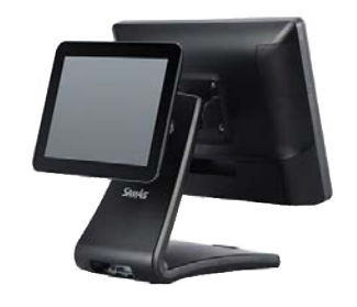
Optional 10" Rear Display