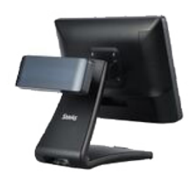
Optional 2 x 20 Customer Display