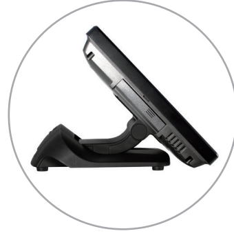
Low Profile Mode