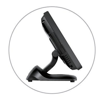
Full Extended Mode

The XT-6015C provides the selection of two foldable bases, the curvy slim GEN7E base and the larger but practical GEN8E base. The foldable base can be configured into "Flat Folded Mode" to save the shipping package volume, "Low Profile Mode" to allow greater interaction between the cashier and the customer, and the traditional "Full Extended Mode". All this can be achieved with a simple pull of the hidden lever.