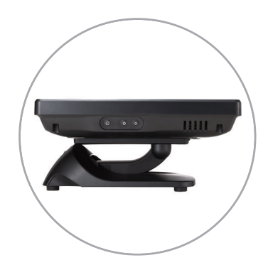
Flat Folded Mode