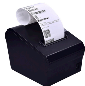
1D and 2D Barcode Printing