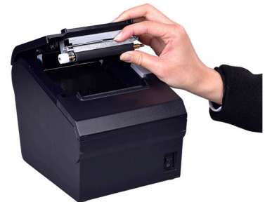
Double fixed cutter design