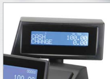
• 2 x Lines x 16 Character Rear Customer Display.

NR-510R RAISED KEYBOARD & SINGLE STATION PRINTING.