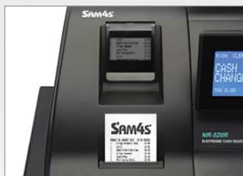
• Single & Twin Station Thermal Printers.