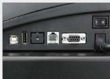
• 2 x Serial Ports & 1 x Type A & 1 x Type B USB Port.