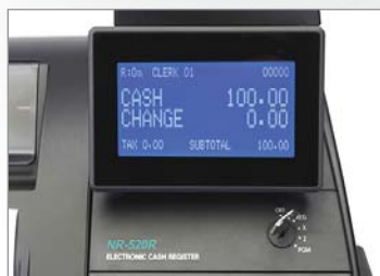
• 8 Line Blue Backlit, Graphic Liquid Crystal Display.

Bar Code Scanning Add a bar code scanner to any of the ER-500 Models. Charge the customer the correct price every time.